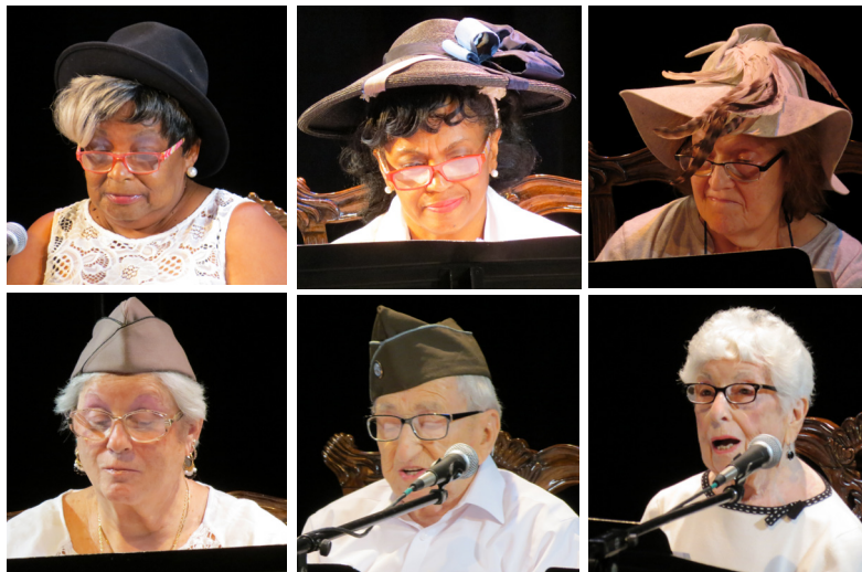
Towers' residents perform their monologues